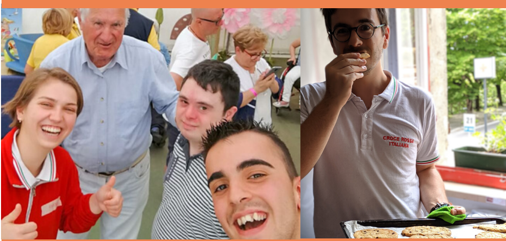
Activities with the elderly and with people with disability

Croce Rossa Italiana Comitato di Cingoli