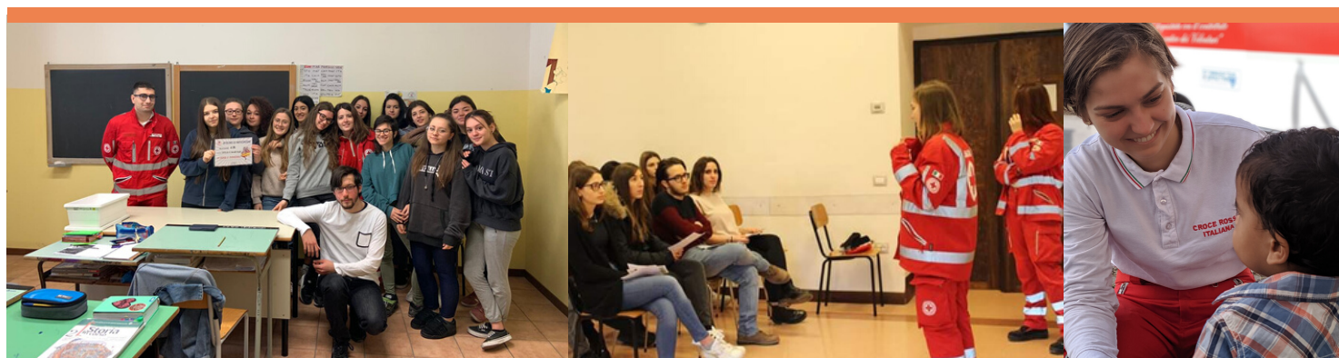
Informative activities in schools